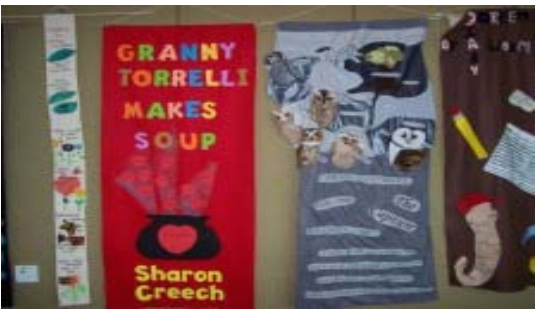
Still more banners