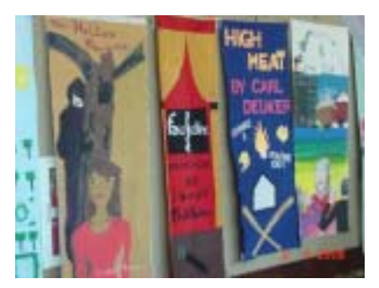
Book Award Banners