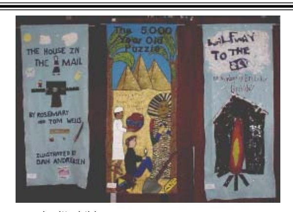
Some of the 70 banners submitted this year.