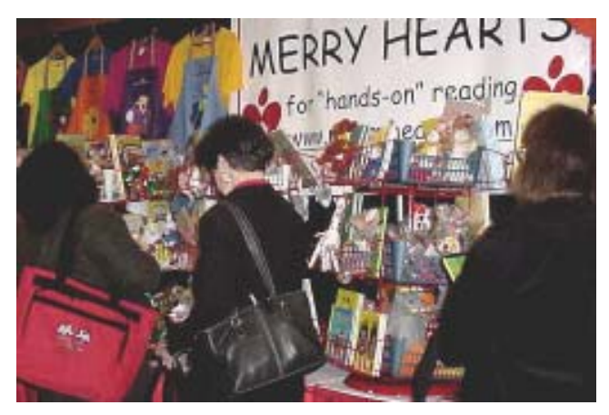
Vendors were kept busy throughout the conference.